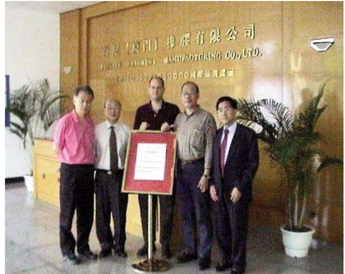
Nimbus team with the CEO of a TS16949 supplier in Xiamen, China