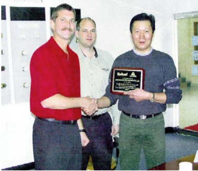
A successful relationship established for Black & Decker's Kwikset