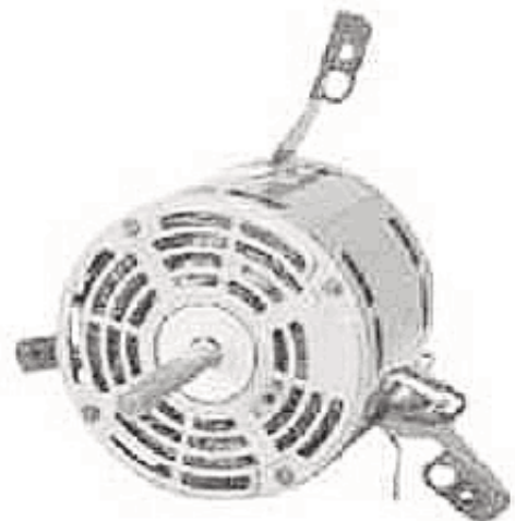
Micro and multi-horsepower motors.

Our goal is to offer the highest value service to enhance your total company profits; to offer the best product so you can increase market share with higher margins.